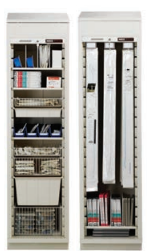
MX4402 Metal Exchange Half Cabinet with FlexLok™ Door. 22"D x 21.62"W x 84.37"H