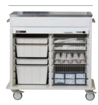
MX6102DK Mid Size Metal Exchange Cart with FlexLok<sup>™</sup> Door and optional Keyless Lock. 26"D x 45.12"W x 44"H