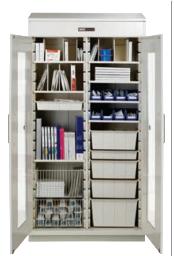
MX4400DHG Metal Exchange Wall Storage Cabinet Hinged Doors with Glass Inserts. 22.75"D x 41"W x 84.37"H